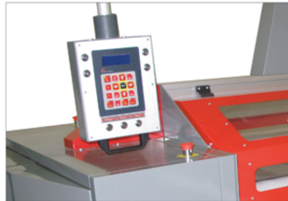
Easy to use movable control panel